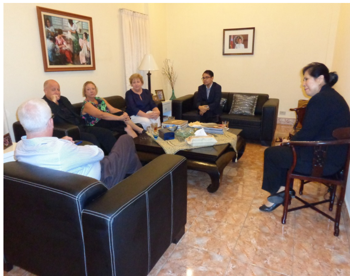
Dinner hosted for the Ambassadors of Australia and New Zealand and their spouses (22 March 2016)