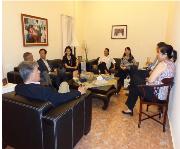
Dinner hosted for the Ambassadors of Brazil, Japan and South Korea and their respective spouses (18 February 2016)